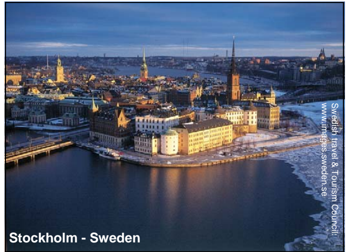
Stockholm - Sweden