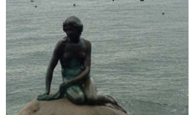
The Little Mermaid - Copenhagen