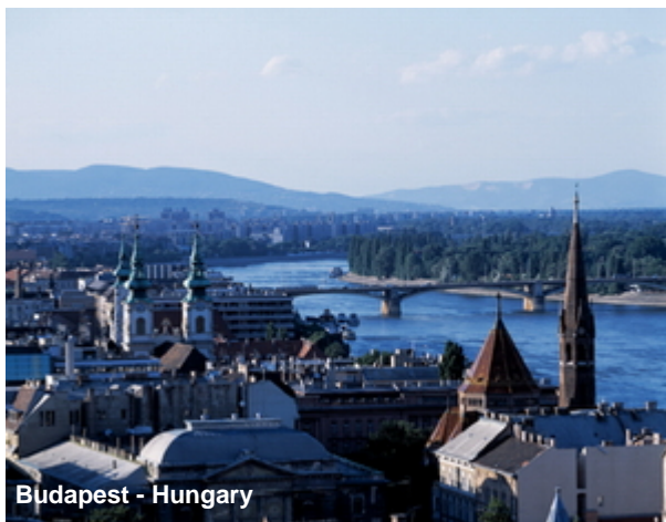
The photogallery of the Hungarian National Tourism Office